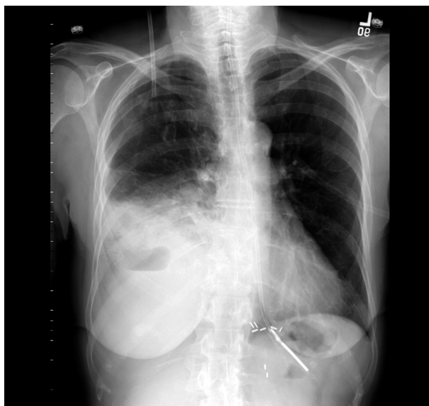
Figure 1. Chest radiograph of the case patient on postoperative day 2 demonstrating hydropneumothorax.